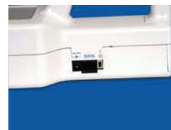
Easily Download Data to PC