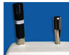
Removable Temp / RH and Isokinetic Probes