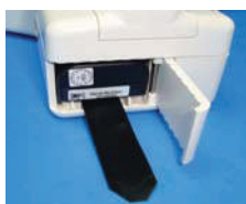
Removable Rechargeable Li-Ion Battery