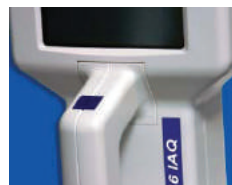
One-handed Operation with Start & Stop on Handle