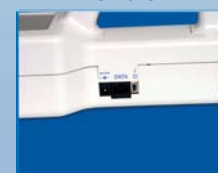
Easily Download Data to PC