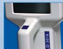
One-handed Operation with Start & Stop on Handle