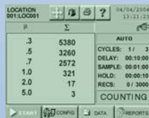
Backlit Touchscreen Interface