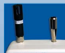
Removable Temp/RH and Isokinetic Probe