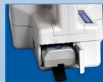
Removable Rechargeable Li-Ion Battery